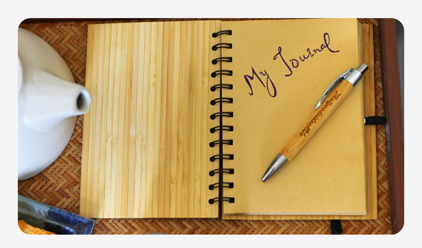
"WHAT BELIEF WILL YOU REWRITE TODAY?"

CALL-TO-ACTION: "WRITE ONE SENTENCE ABOUT A LIMITING BELIEF YOU'LL CHALLENGE TODAY."