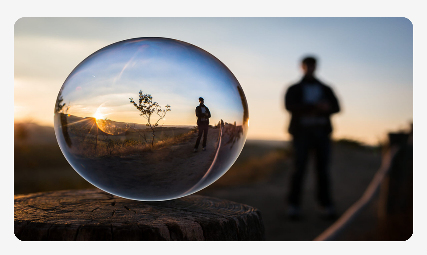
"WHAT LEGACY WILL YOUR LEADERSHIP CREATE

CALL-TO-ACTION: "WRITE ONE SENTENCE ABOUT THE IMPACT YOU WANT YOUR LEADERSHIP TO HAVE IN FIVE YEARS."